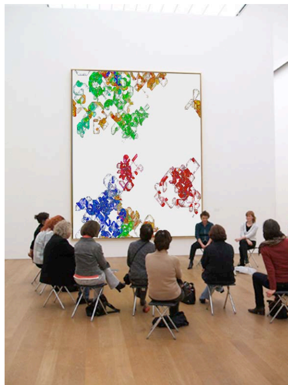
Figure 1: Generative art in an art world setting

Moreover, by enriching the experiment with generative art works [4] side by side with non-generative, man-made works, a further hypothesis, orthogonal to the first one, can be tested: in the verification of the institutional stance the computer-generated works obtain similar results to the others, and, thus, are undistinguishable from this point of view.